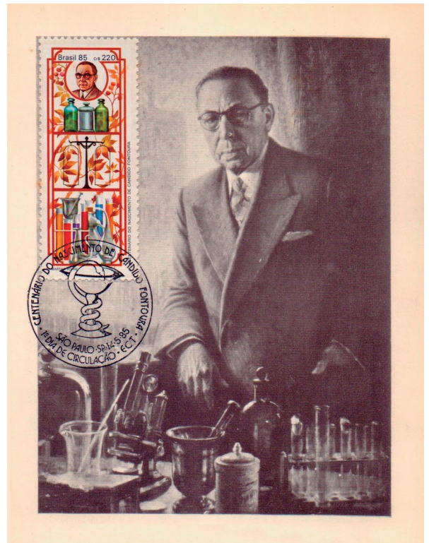
CÂNDIDO FONTOURA - "O Homem e sua Obra" - óleo sobre tela de autoria de J. U. Campos.

Nothing is more just than a man of this magnitude to be the Patron of this Honor.